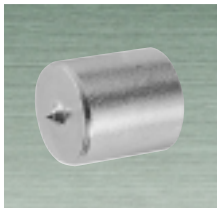
Adaptor with steel ball (New type) (Unit : mm)