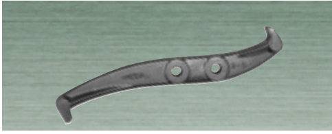
Claw (One piece)